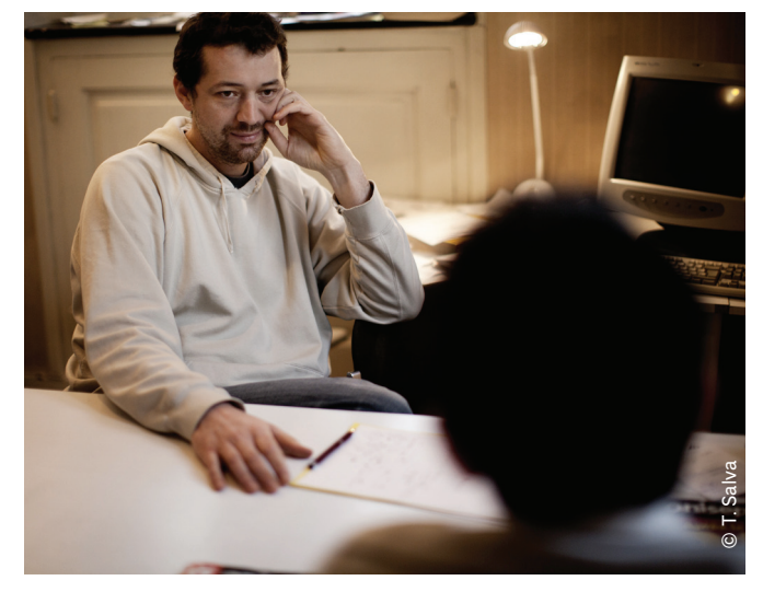
Fondation de France supported the creation of an information and assistance space for victims at Association Montjoye. Discover this project through a video available on www.fondationdefrance.org

We have organized a seminar with the organizations supporting victims and some victims themselves to assess how best to use the funds still available. We have detected specific vulnerability in people who were already fragile before the attacks. Any existing social or mental distress provide a fertile ground for long-term effects of post-traumatic stress. Some people still feel so anguished that they are absolutely incapable of returning to their professional activity. Even if recovery is of course possible, it is usually a long process and will not erase trauma and pain, which become part of everyday life for a very long time. Beyond essential psychological support, other kinds of assistance must be therefore also considered. The assistance of professional social workers offered by organizations supporting victims seems to be increasingly necessary. In fact, they can propose diverse solutions tailored to each victim's situation, responding as closely as possible to a variety of situations.