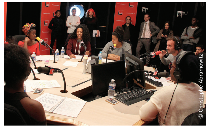
The 'Interclass' project gives teenagers an opportunity to work closely with journalists (here at France Inter radio station) and learn how to analyze and package information.

You can find more details about these projects at www.fondationdefrance.org.