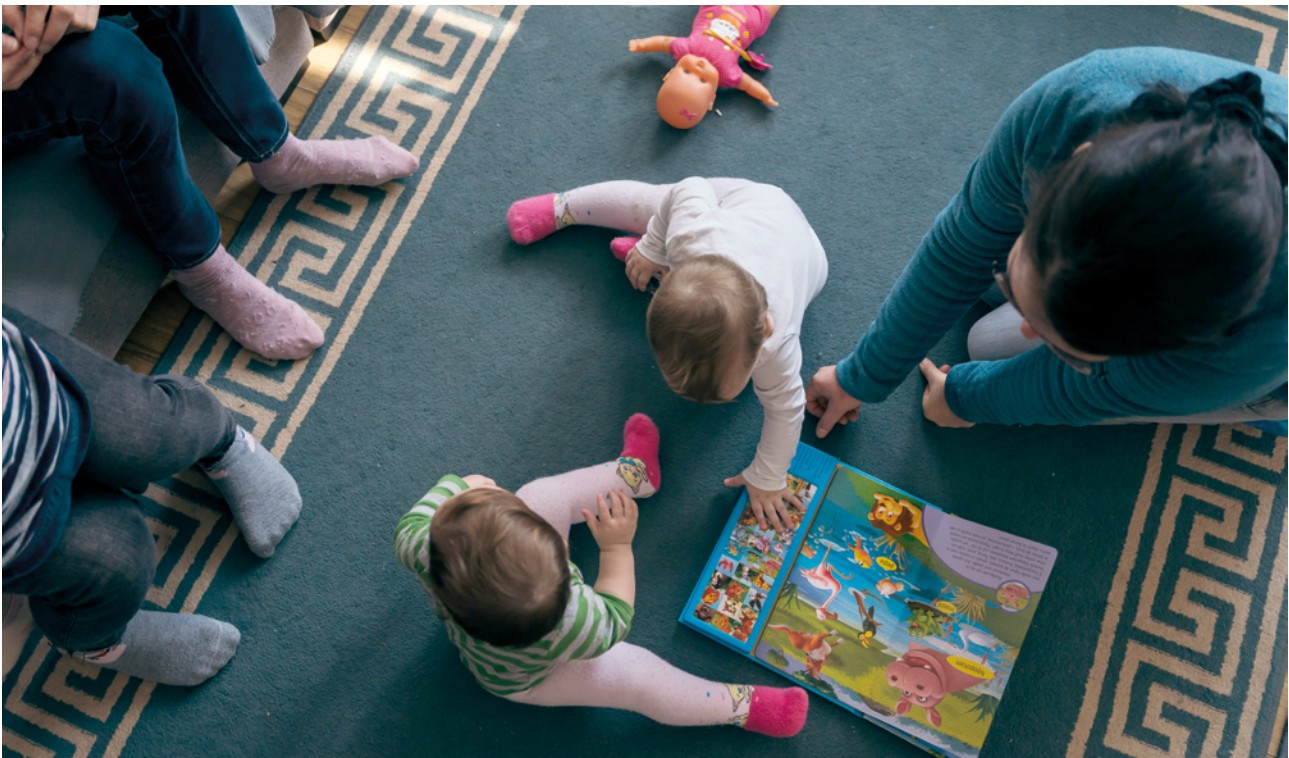
The Hope and Homes center hosts refugee children in Romania.

Finally, in Poland , the Saint-Nicholas Foundation , a Polish charity that has been working for children for around 20 years, has launched a call for projects from Polish civil society to help Ukrainian refugee children by providing them with activities (sports or artistic workshops, outings, games, etc.), psychological support, language courses, school supplies and support, etc. Ten of their projects have received support from Fondation de France.