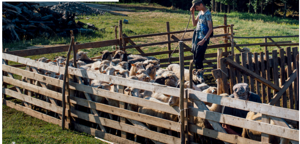
The craftwork and agricultural cooperative Longo Mai, South West of Ukraine, welcomes displaced people.