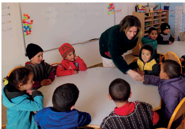
In Titane, a village located in the Taroudant mountains, nonprofit Tibu rehabilitated the school partially destroyed by the quake.