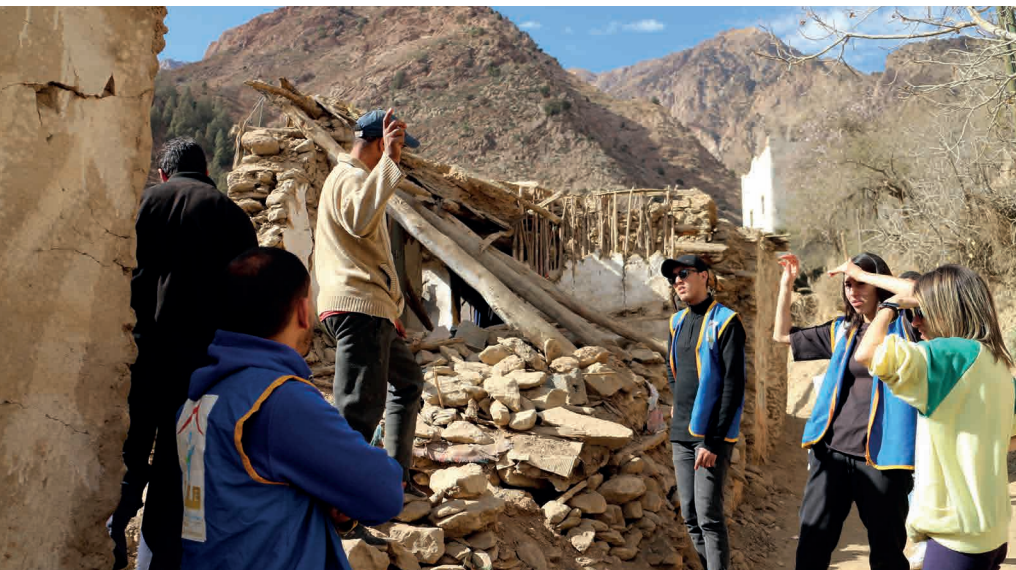
Teams from the Amane Foundation and Fondation de France in the villages destroyed by the earthquake.