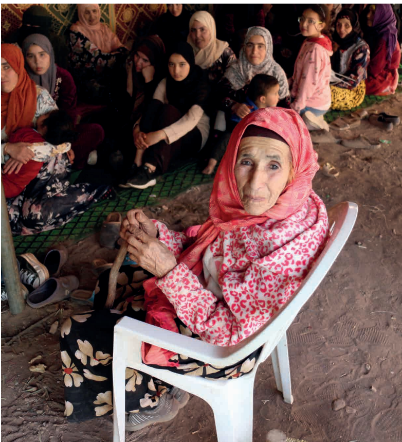
Nonprofit Elkhir supports women who were affected by the earthquake in Taddart, a village tucked away in the Middle Atlas,