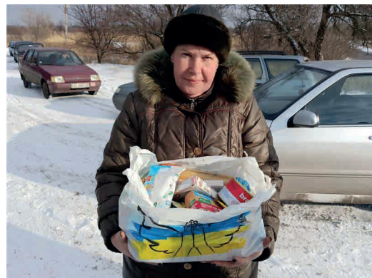
Nonprofit Angels of Salvation distributing first necessities.

To cope with an emergency in an emergency situation, following the destruction of the Kakhovka dam in June 2023, several partners received one-off support to document environmental damage, distribute food and water to people who were flooded and evacuate them to safe places.