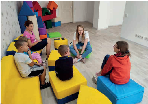
Nonprofit Your Support offers psychosocial sessions for displaced children in Lviv, Ukraine.