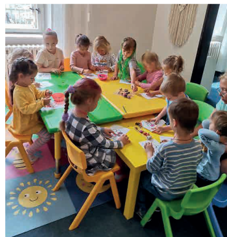
The Carpathian Foundations Network organizes activities to help integrate Ukrainian refugees in Slovakian schools.