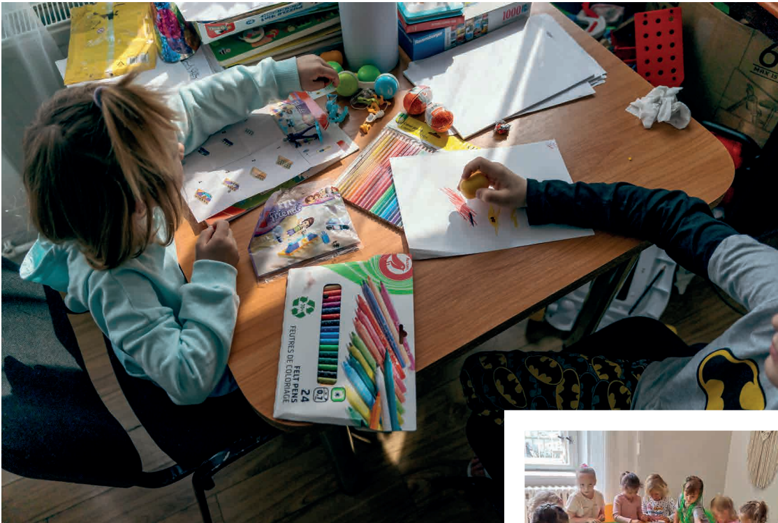
The Hope and Homes center welcomes refugee children in Romania.