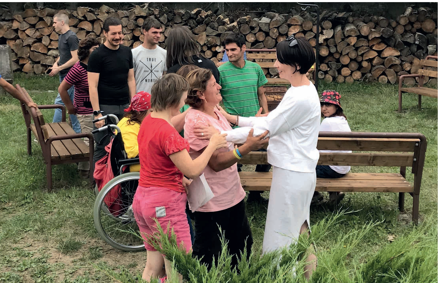
The CAM-Z Parasolka welcome center is for young disabled people from the region of Tiatchiv who benefit from medical care, specialist education and income-generating revenue initiatives.

Lastly, because the issue of welcoming refugees concerns several countries, the Carpathian Foundations Network (Slovakia, Hungary and Ukraine) is active throughout Europe. They broadcast messages to the general public to combat prejudice concerning Ukrainian refugees, and they also provide practical and financial support to the local organizations working with the most vulnerable people.