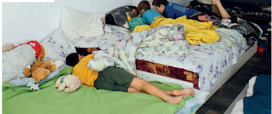
Welcome center for displaced Ukrainian people in Lviv, set up by Triangle Génération Humanitaire.