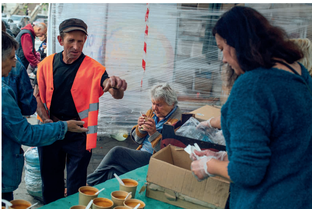
World Central Kitchen organizing the distribution of food in Lviv, Ukraine.