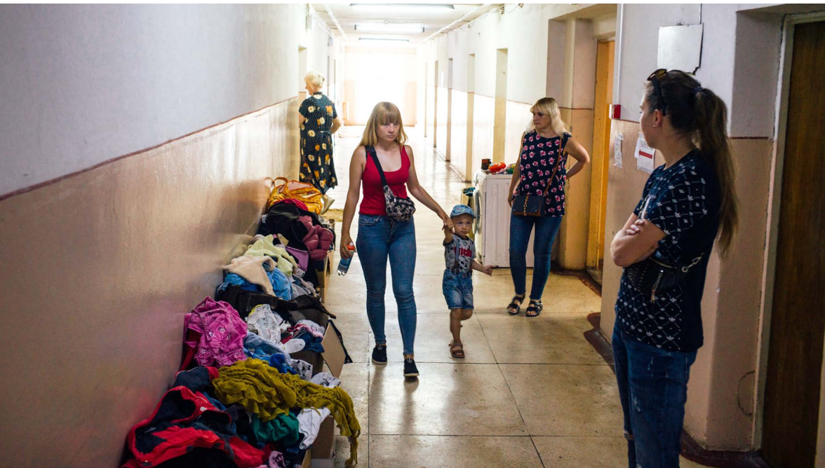
Uzghorod University, where the Carpathian Foundation welcomes displaced persons, women and children in particular.