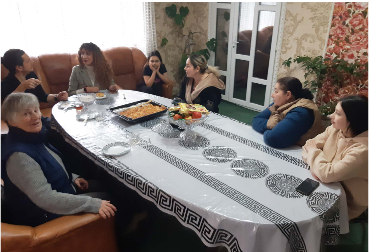
In Moldova, the Roma Awareness Foundation caters for basic necessities such as accommodation and food for Roma refugees from Ukraine.

In Romania, Concordia , a nonprofit specialized in social care for children, provides comprehensive assistance to Ukrainian refugee families, from temporary accommodation to psychological and administrative support. It also organizes leisure and educational activities for the youngest, to help them hold the trauma of war at bay. Over the last six months, support has been provided to more than 700 people, mostly women and children.