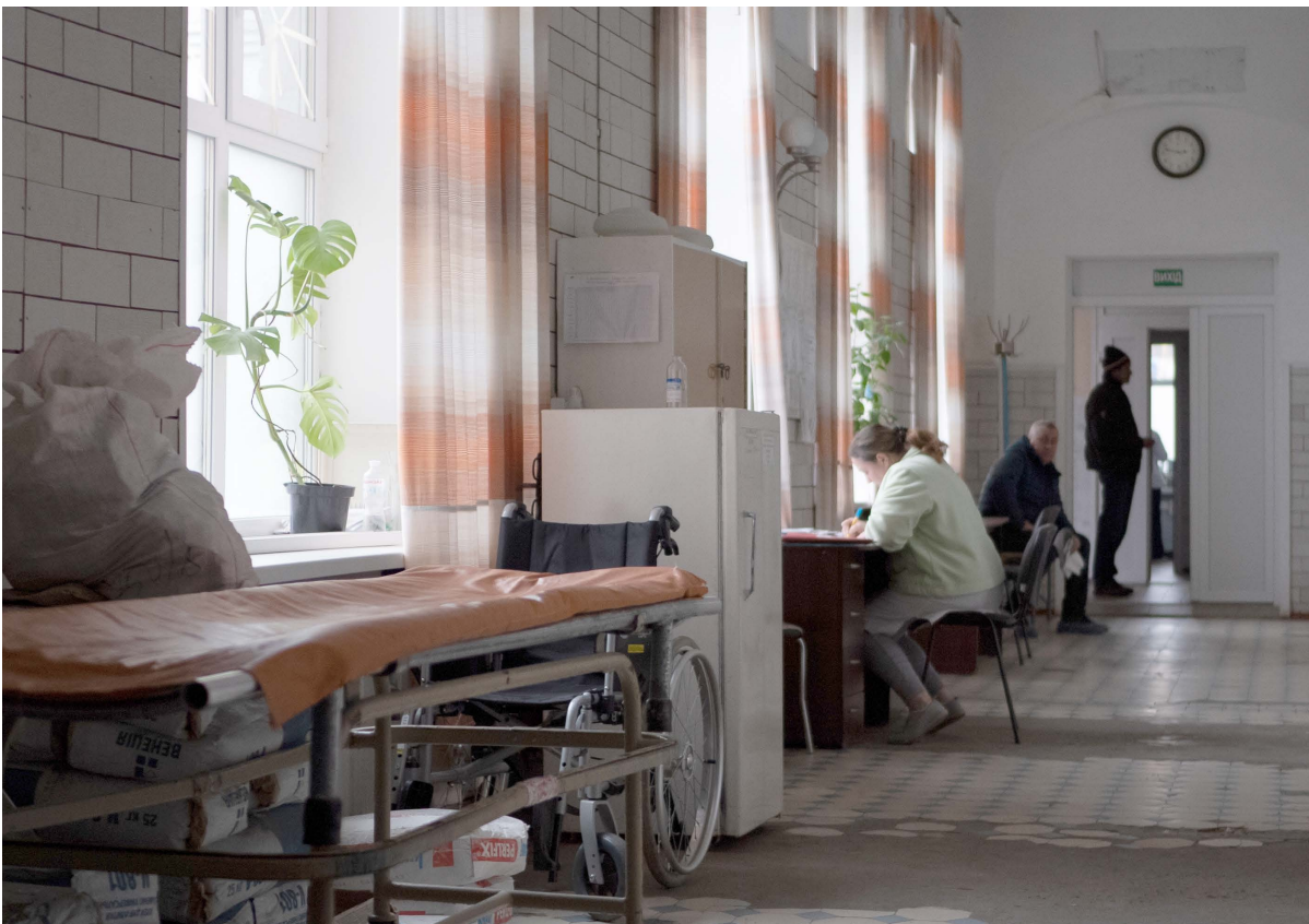
Nonprofit CAM-Z install generators in hospitals, which are vital in the event of power outages.

Because lighting and heating are needed – especially in winter, as well as shelter and food, Fondation de France supports a number of initiatives to equip welcome centers and hospitals with generators. Électriciens sans frontières (Electricians Without Borders) and CAM-Z install generators in collective establishments like hospitals, where power outages endanger the lives of patients in intensive care. For its part, Angel of Salvation provides heating to accommodation centers for refugees who come from the front line or occupied areas.